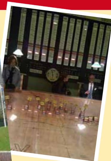
▲ The bunker's 'tote board' is set to the 15th September 1940, when, visiting the bunker, Winston Churchill asked what reserves were available, to be told 'none'. ◀ Air Vice Marshal Keith Park, whose 11 Group bore the brunt of the fighting during the Battle, surveys the flags of the nationals who fought for Britain.