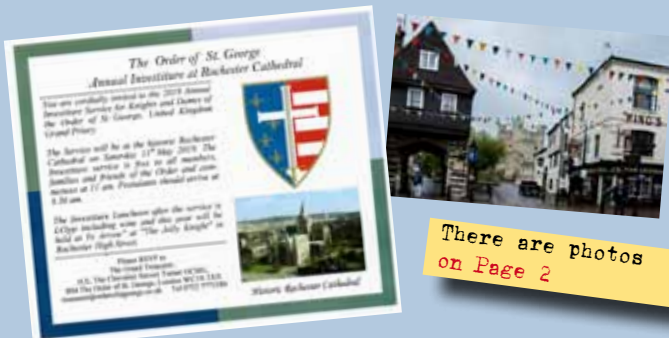
There are photos on Page 2

We were particularly please this year to welcome representatives from the Canadian and Hungarian Orders of St. George, making the day very much an international affair.