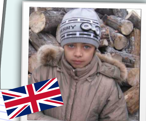
The Order has given financial support to ChildAid, a British charity working with Ukrainian child refugees in Moldova.